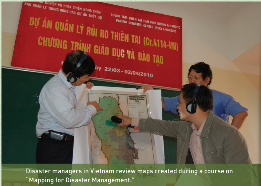
Disaster managers in Vietnam review maps created during a course on "Mapping for Disaster Management."