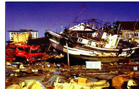
1993, Okushiri Island, Japan

disseminates tsunami information and warning messages to over 100 points across the Pacific. Regional tsunami warning centers operated by the U.S.A., France, and Japan provide regional warnings to the U.S. Alaska and west coast and Canada, French Polynesia, and the northwest Pacific, respectively. The Tsunami Warning System in the Pacific is one of the most successful international scientific programmes with the direct humanitarian aim of mitigating the effects of tsunami to save lives and property.